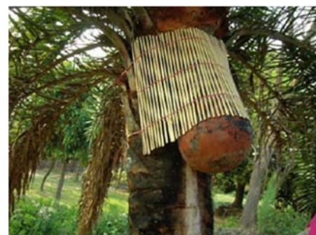
Figure 3. Bamboo skirt method to block fruit bats contamination date palm sap.

Prevention strategies should focus on the people (Gachhis) along with their families who collect the date palm sap and also the health caregiver who will attend the Nipah cases. Various local approaches have been developed to prevent pests and bats from accessing the sap. But most efficient is the bamboo skirt method (Figure 3) which covers both the shaved part of the tree and also the mouth of the pot, making it difficult for the bat to access the sap. Other methods like using mosquito net or cloth to cover the mouth of the containers should also be employed where necessary [31]. Gachhis should take bath after collection of palm sap as the surfaces of trees are often contaminated with bats urine harbouring the Nipah virus. After collection, they should refrain from drinking it raw; instead of boiling at high temperature is the single most effective method of prevention. Family members reporting to health-care with fever or flu-like symptoms should be given special attention. Residence from Nipah belt [32] should be made aware prior to every winter season through a mass media campaign (Figure 4). More emphasis should be put on a person to person communication by health care worker through courtyard or group meetings with special emphasis on those families who live on date palm sap collection and selling trade.