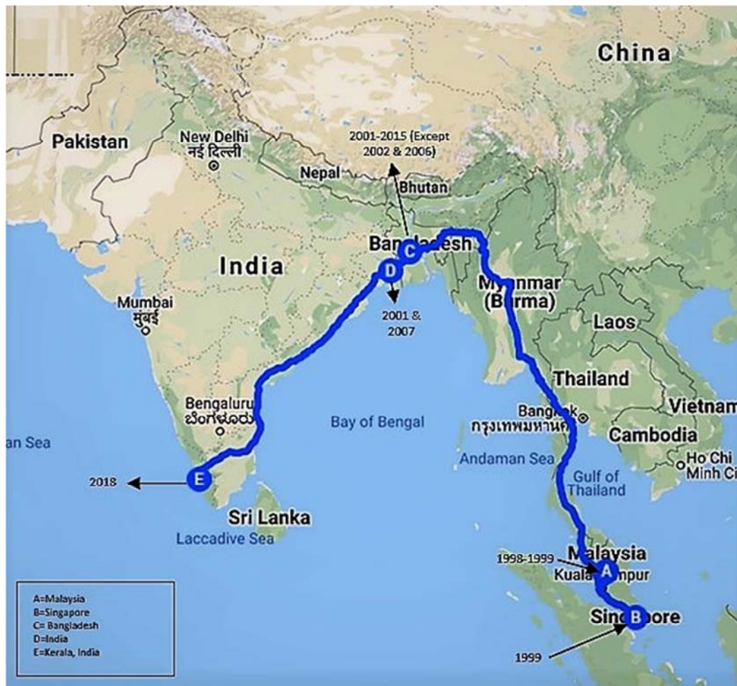
Figure 1. Trail of Nipah virus infection in South East Asia Region.

quantitative and qualitative studies, estimates of Nipah cases, the source of infection, policy analysis, and government strategies. Data gleaned from the research papers were analyzed and results were presented in texts and chart/graph as per the requirements.